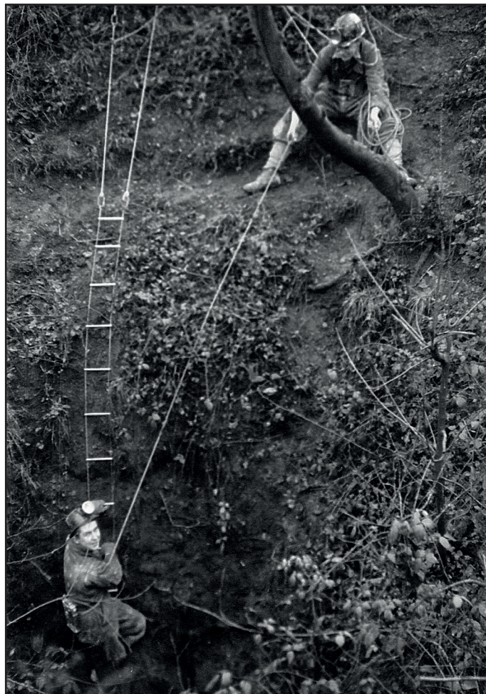
Photo 3: Entrance to one of the Hangman's Wood deneholes.

To complete and conclude a rather pixilated Forum , this and the preceding page contain a selection of Harry Long's 1950s images, which Phil Wolstenholme has optimized using recent technology. These images relate to the deneholes at Hangman's Wood, near