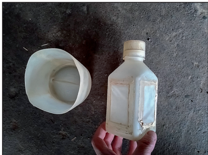
Figure 4: Filtering bottle (Brancelj, 2004) and bailing jug. The bottle has mesh-lined holes on two sides and can be carried inside the jug to protect the mesh screens during transportation between sampling sites.

For the trial to study fauna originating from drips in British caves, collecting trays were placed at four locations in each of the three geographically spread caves, two of which have previously been surveyed for aquatic fauna in streams and pools within the systems. Each collecting tray consisted of a plastic box 17.5cm by 14.5cm with two windows (approximately 8cm by 3cm) cut in opposite sides (2.5cm above the bottom of the box) and lined with 63µm mesh. A single funnel was positioned in the tray to catch and channel most of the water dripping from above (Fig.3). The trays were emptied periodically, approximately every three to four months, although the time periods were not fixed. The contents of the trays were poured into a filtering bottle (design as specified in Brancelj (2004), Fig.4) to reduce the volume and concentrate the sample, then poured into a vial and topped up with ethanol for transportation back to the laboratory.