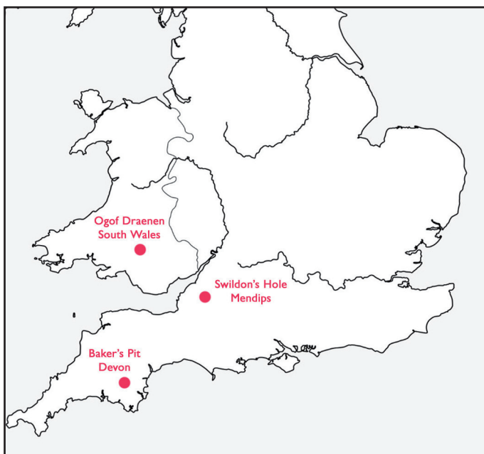
Figure 2: Map of southern Britain showing the locations of the three study sites.

Ogof Draenen in southern Wales is Britain's second longest cave, with more than 70km of mapped passage spanning a vertical range of 148m, located near the southern edge of the Brecon Beacons, within the Dinantian Carboniferous limestone sequence of the North Crop (Farrant and Simms, 2011). The system contains an extensive network of vadose streams, fed