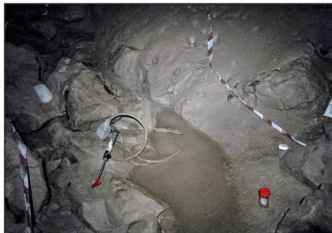
Figure 5: Drip-fed pool sampling. (Above): pool at Site 3, Ogof Draenen; (Below): sampling large pool at Site 4, Baker’s Pit. Pools being pumped with a bilge pump and the water passed through a filtering bottle to concentrate the sample.

The cave systems and locations of the collecting trays are listed in Table 1, along with estimations of their depth beneath the land surface. The equipment was deployed in late January and early February 2016 and removed in late March and early April 2022. With the exception of Site 4 in Draenen, all of the trays were placed beneath water dripping from stalactites above. At the location of Site 4 there were few such areas and instead this last tray was placed in a fissure that channelled trickling water. When deployed, the tray was wedged into the fissure to intercept the trickling flow and no funnel was required. The discharge rates of the drips were not measured, although seasonal oscillations were noted, thus the samples were likely to be an amalgamation of both rapid and slow infiltration flows.