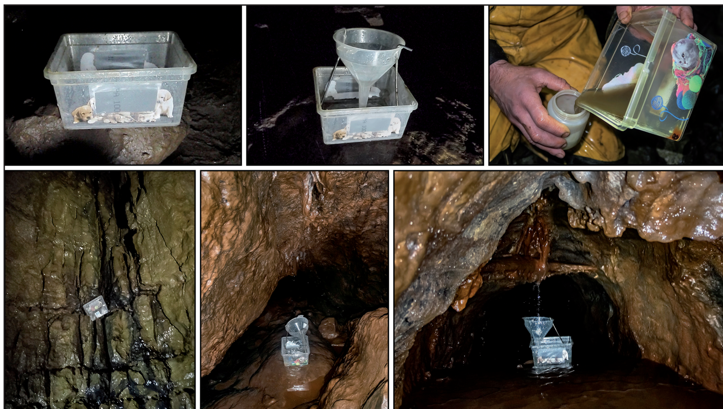
Figure 3: Trays used to sample dripping water. Top row (left to right): tray design, tray fitted with funnel, pouring sample into vial of preservative. Bottom row (left to right): Site 4, Ogof Draenen, tray without funnel wedged in fissure; Site 3, Baker's Pit, Site 1, Baker's Pit.

The funnel and container are left in situ and as water drips from the cave ceiling, sometimes carrying aquatic fauna from the epikarst within it, it accumulates in the container which is designed so that a 1cm-deep layer of water collects at the bottom, enough for small copepods to live in, whilst the rest of the water is filtered and escapes, thus quite large volumes of dripping water can be filtered passively, and their fauna sampled by this method.